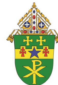
Diocesan Coat of Arms

Confessions: First Saturday of the month, 11:00-11:30 AM at St. Ambrose or by appointment with the Pastor.